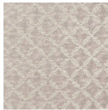
1699-04 GUIPURE - POUFRE