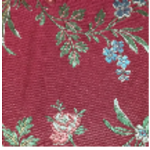
4020-01 LAMPAS ALBATROS - ROUGE