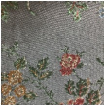
4020-02 LAMPAS ALBATROS - CIEL