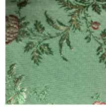
4020-05 LAMPAS ALBATROS - AMANDE