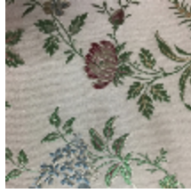
4020-03 LAMPAS ALBATROS - CREME