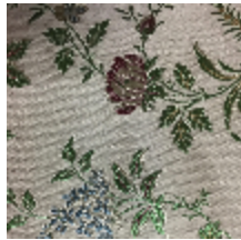
4020-03 LAMPAS ALBATROS - CREME