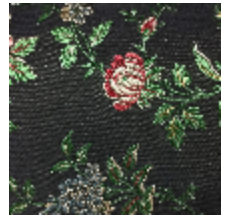
4020-06 LAMPAS ALBATROS - NOIR