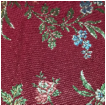
4020-01 LAMPAS ALBATROS - ROUGE