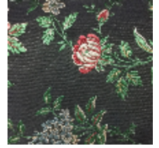
4020-06 LAMPAS ALBATROS - NOIR