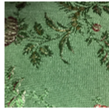
4020-05 LAMPAS ALBATROS - AMANDE