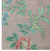
4020-04 LAMPAS ALBATROS - SAUMON