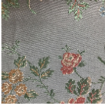
4020-02 LAMPAS ALBATROS - CIEL