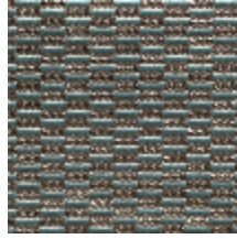
0496-08 KOZO - FJORD