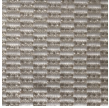
0496-01 KOZO - IVOIRE