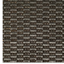
0496-10 KOZO - ETAIN