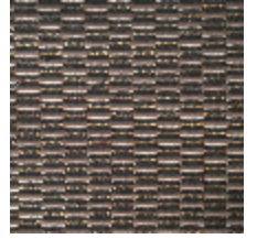
0496-11 KOZO - TAUPE *