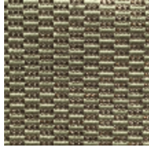
0496-07 KOZO - ROSEAU