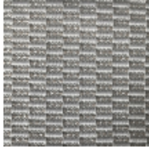
0496-02 KOZO - CRAIE