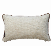
7310-04 COUSSIN BIBI COURT CRAIE