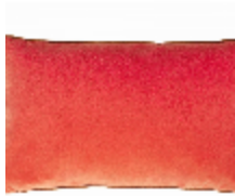
7310-01 COUSSIN BIBI COURT CAPUCINE