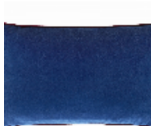
7310-03 COUSSIN BIBI COURT NAUTILUS