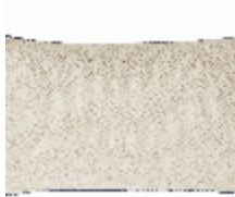
7310-02 COUSSIN BIBI COURT DUNE