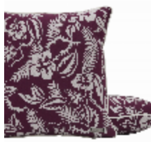
7798-04 COUSSIN OUEVA FUCHSIA *