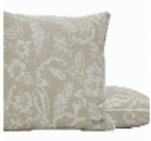
7798-01 COUSSIN OUEVA NATUREL *