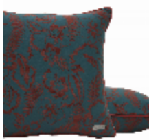
7798-03 COUSSIN OUEVA CANARD *