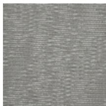
1361-03 FILAMENT M1 - RIZ