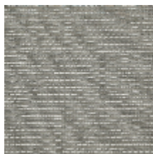
1361-02 FILAMENT M1 - ARGENT