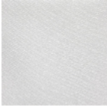
1366-02 ALLIAGE M1 - CRISTAL