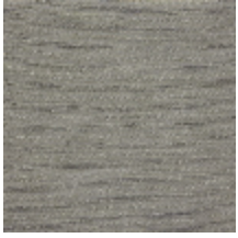
1366-01 ALLIAGE M1 - BRONZE