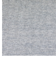
1482-04 FARNIENTE - FUMÉE