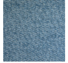
1482-06 FARNIENTE - OCEAN