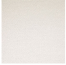
1482-01 FARNIENTE - BLANC