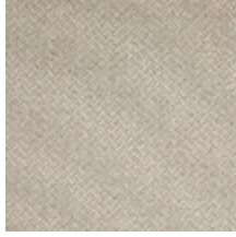
1482-02 FARNIENTE - BEIGE