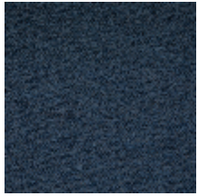
1482-07 FARNIENTE - MARINE