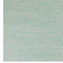
1482-05 FARNIENTE - ACQUA