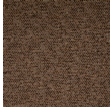
1482-03 FARNIENTE - BRUN