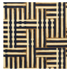
1487-05 NUANCES - CAMEL