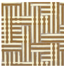
1487-02 NUANCES - TOURTERELLE