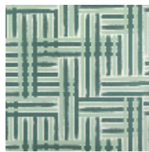
1487-04 NUANCES - CELADON