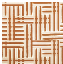
1487-03 NUANCES - POUDRE