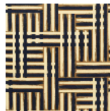
1487-05 NUANCES - CAMEL