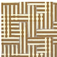
1487-02 NUANCES - TOURTERELLE