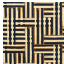
1487-05 NUANCES - CAMEL