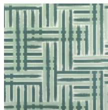
1487-04 NUANCES - CELADON