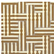
1487-02 NUANCES - TOURTERELLE