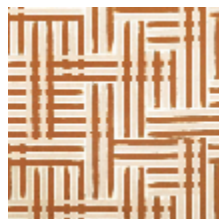
1487-03 NUANCES - POUDRE