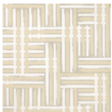
1487-01 NUANCES - NATUREL