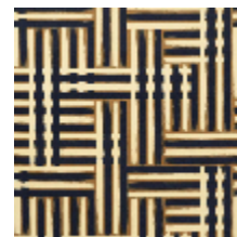
1487-05 NUANCES - CAMEL