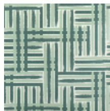
1487-04 NUANCES - CELADON