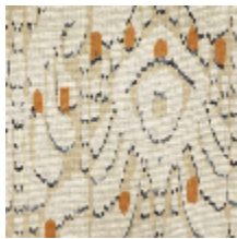
1488-01 IKATI - NATUREL