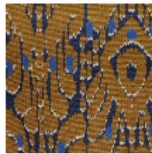
1488-04 IKATI - CAMEL