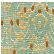
1488-03 IKATI - CELADON