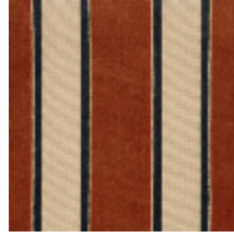
1489-04 GALERIE - TERRACOTTA