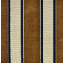
1489-02 GALERIE - CAMEL