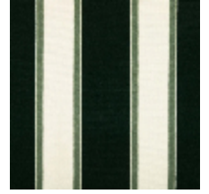
1489-06 GALERIE - FORÊT