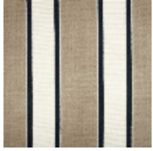
1489-01 GALERIE - NATUREL