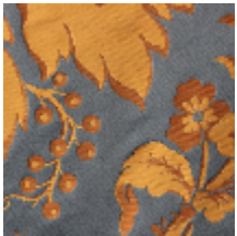
1501-01 LES ANANAS S&D 65 - BLEU