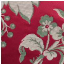
1501-02 LES ANANAS S&D 65-CRAMOISI