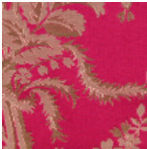
1505-03 MESANGES - ROUGE