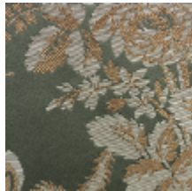
1505-05 MESANGES - VERONESE