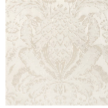
1508-06 LES ANANAS 130CM - NACRE