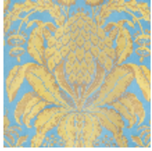
1508-01 LES ANANAS 130CM - BLEU