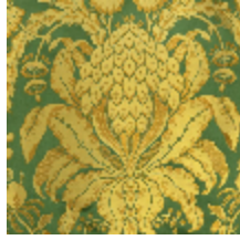
1508-04 LES ANANAS 130CM - VERT