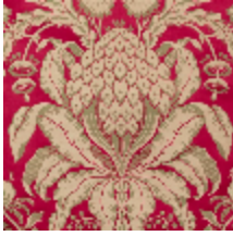
1508-02 LES ANANAS 130CM - CRAMOISI