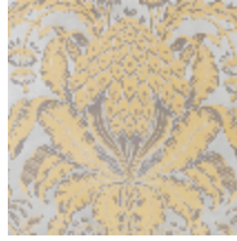
1508-05 LES ANANAS 130CM - OPALE