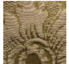
1525-37 MEILLANT - BRONZE *