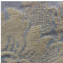
1525-39 MEILLANT - BLEU *