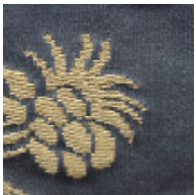
1525-38 MEILLANT - NUIT *