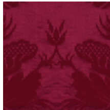
1525-33 MEILLANT - CRAMOISI *