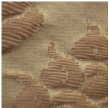
1525-30 MEILLANT - JAUNE *