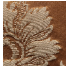
1525-36 MEILLANT - ECAILLE *