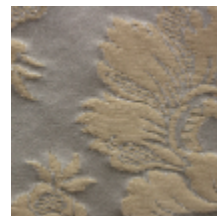
1525-41 MEILLANT - VERT DE GRIS