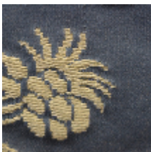
1525-38 MEILLANT - NUIT