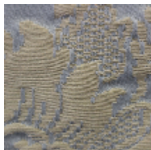
1525-39 MEILLANT - BLEU