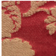
1525-32 MEILLANT - ROUGE