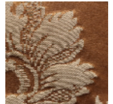
1525-36 MEILLANT - ECAILLE *