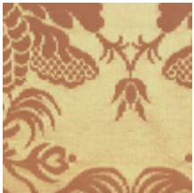
1525-03 MEILLANT - CHAMPAGNE *