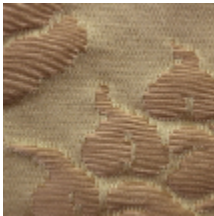
1525-30 MEILLANT - JAUNE