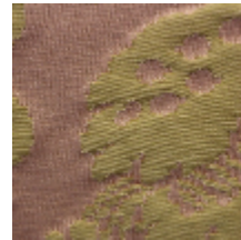
1525-35 MEILLANT - ROSE