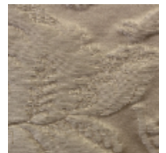
1525-42 MEILLANT - CHAMPAGNE