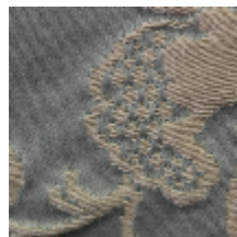
1525-40 MEILLANT - VERT