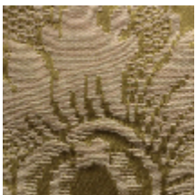
1525-37 MEILLANT - BRONZE