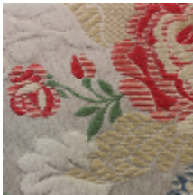
1527-02 SAINT CLOUD - CREME