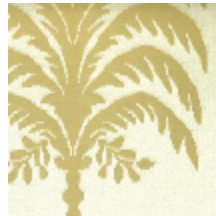
1528-28 LES CHINOIS - CREME/OR *