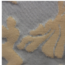
1528-27 LES CHINOIS - BLEU *