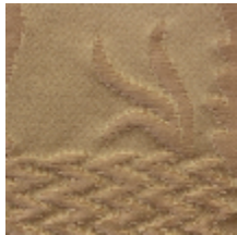
1528-12 LES CHINOIS - JAUNE *