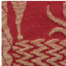
1528-26 LES CHINOIS - ROUGE *