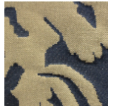
1528-40 LES CHINOIS - MARINE *