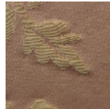
1528-39 LES CHINOIS - CANNELLE *