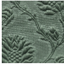
1530-25 POMMES DE PIN- SEVRES