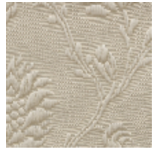
1530-20 POMMES DE PIN- IVOIRE