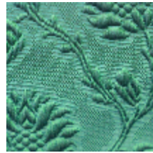
1530-16 POMMES DE PIN- VERT BLEU *