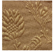
1530-34 POMMES DE PIN- OR *