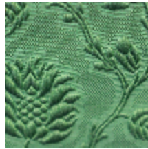
1530-15 POMMES DE PIN - VERT VIF *