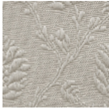
1530-21 POMMES DE PIN- PERLE