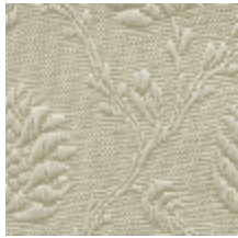
1530-01 POMMES DE PIN- CREME *