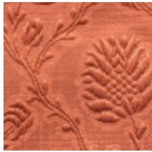
1530-32 POMMES DE PIN- AMBRE *