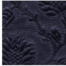
1530-28 POMMES DE PIN- ROYAL