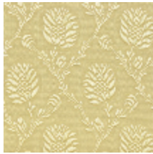
1530-03 POMMES DE PIN- CHAMPAGNE