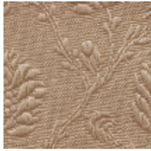
1530-23 POMMES DE PIN- PLATINE