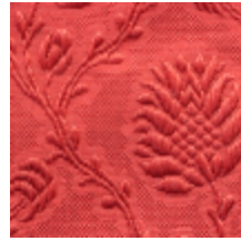
1530-30 POMMES DE PIN- RUBIS