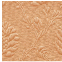
1530-08 POMMES DE PIN- FEU *