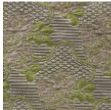
1531-04 CARMONTEL - CHARTREUSE *