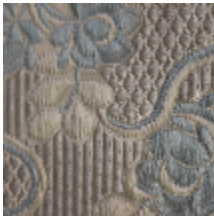
1531-03 CARMONTEL - BLEU *