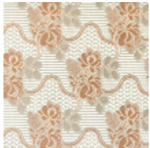
1531-01 CARMONTEL - ABRICOT *