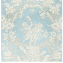
1539-01 LES AMOURS - BLEU