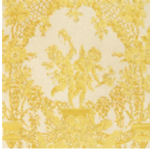
1539-02 LES AMOURS - CREME/OR