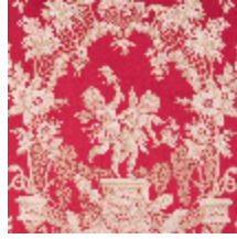
1539-04 LES AMOURS - ROUGE