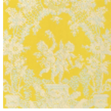
1539-03 LES AMOURS - JAUNE