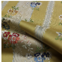
1542-03 RHEA - JONQUILLE