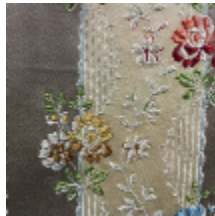
1542-06 RHEA - TAUPE CLAIR *