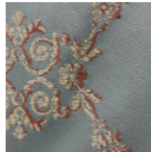
1545-04 CHARLES X - VERT