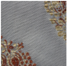
1545-01 CHARLES X - BLEU