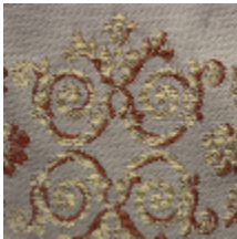
1545-02 CHARLES X - CREME