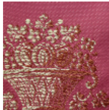
1545-03 CHARLES X - ROUGE