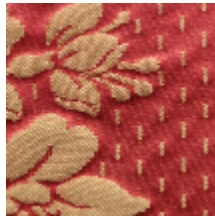
1549-26 ALEXANDRA - ROUGE/OR *