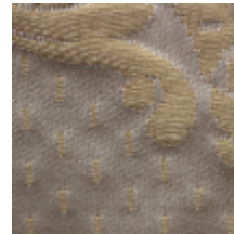
1549-28 ALEXANDRA - CREME/OR *