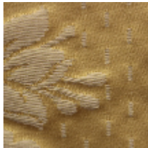
1549-20 ALEXANDRA - OR *