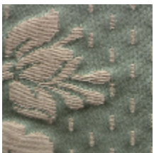
1549-15 ALEXANDRA - EMERAUDE *