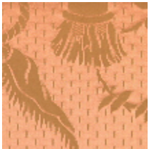
1549-07 ALEXANDRA - ROSE/CREME *