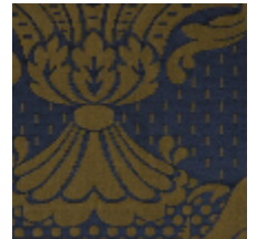
1549-40 ALEXANDRA - MARINE *