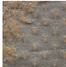
1549-27 ALEXANDRA - BLEU *