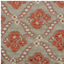
1552-10 JOSELIN - CORAIL