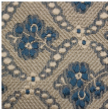
1552-09 JOSELIN - BLEU