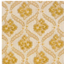
1552-11 JOSELIN - OR