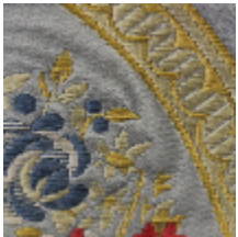
1553-01 MARIE ANTOINETTE - BLEU