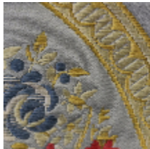
1553-01 MARIE ANTOINETTE - BLEU