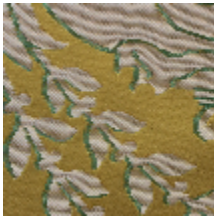
1562-03 MURAT S&D - JAUNE