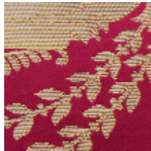
1562-04 MURAT S&D - ROUGE