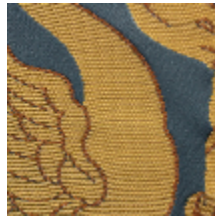
1562-06 MURAT S&D - FAIENCE