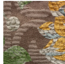
1573-06 PAIVA - TAUPE FONCE *