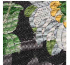
1573-07 PAIVA - NOIR