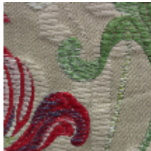
1573-02 PAIVA - BIS