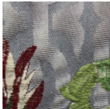
1573-01 PAIVA - NATTIER