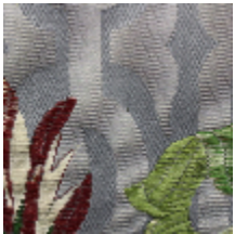
1573-01 PAIVA - NATTIER