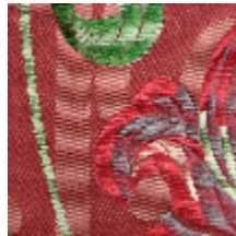
1573-04 PAIVA - RUBIS *