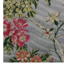
1638-05 LA FAVORITE - BLEU