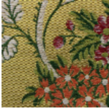
1638-02 LA FAVORITE - OR