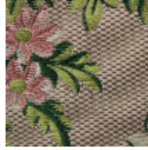
1638-04 LA FAVORITE - TAUPE *