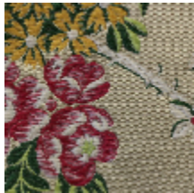
1638-01 LA FAVORITE - PARCHEMIN