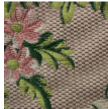
1638-04 LA FAVORITE - TAUPE *