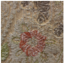
1639-01 ARGENTAN - BEIGE