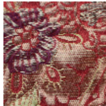
1639-04 ARGENTAN - ROUGE