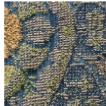
1639-05 ARGENTAN - BLEU