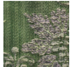
1639-06 ARGENTAN - VERT