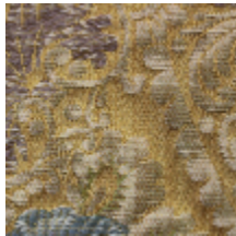
1639-02 ARGENTAN - OR