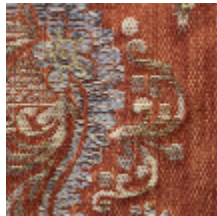
1639-03 ARGENTAN - CUIVRE