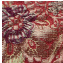
1639-04 ARGENTAN - ROUGE