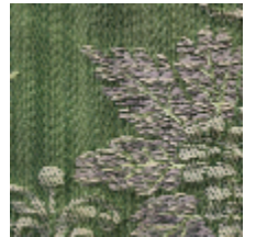
1639-06 ARGENTAN - VERT