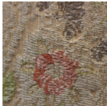
1639-01 ARGENTAN - BEIGE