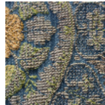
1639-05 ARGENTAN - BLEU