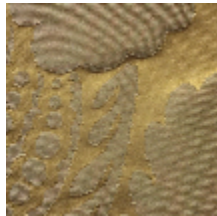
1650-04 VOLANGES- BRONZE *