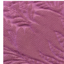
1650-06 VOLANGES- TRAVIATA