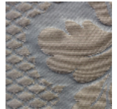
1650-07 VOLANGES- OPALE