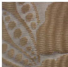
1650-10 VOLANGES-VIEL ARGENT *