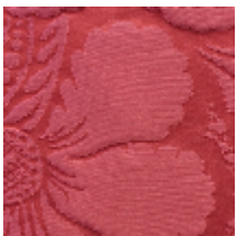
1650-08 VOLANGES- RUBIS