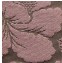
1650-05 VOLANGES-PUCE *