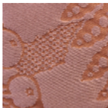
1650-09 VOLANGES- CORNALINE *