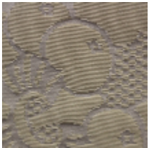
1650-02 VOLANGES- IVOIRE *