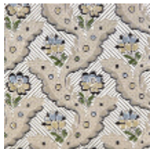
1651-01 DANCENY- IVOIRE