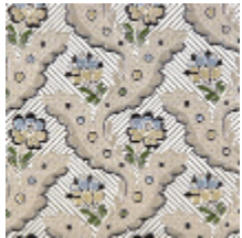
1651-01 DANCENY- IVOIRE