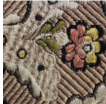
1651-03 DANCENY-BOIS DE ROSE