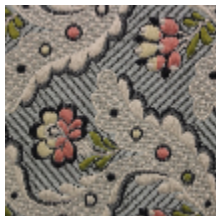
1651-02 DANCENY- PASTEL