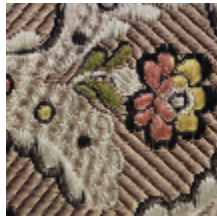
1651-03 DANCENY-BOIS DE ROSE