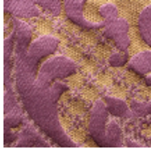
1653-01 LOUIS-PHILIPPE- POURPRE