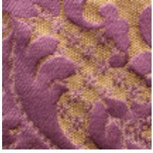
1653-01 LOUIS-PHILIPPE- POURPRE