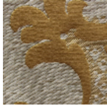
1653-04 LOUIS-PHILIPPE- OR