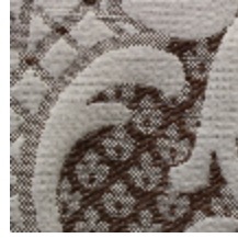
1653-07 LOUIS-PHILIPPE- ARGENT