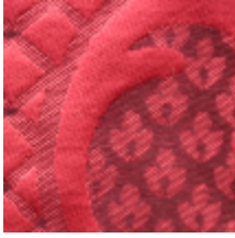
1653-02 LOUIS-PHILIPPE- RUBIS