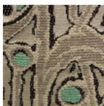
1660-02 LALIQUE - IVOIRE