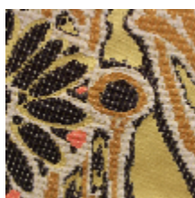
1660-01 LALIQUE - OR