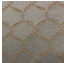
1663-03 CHOISY SEMÉ - PASTEL