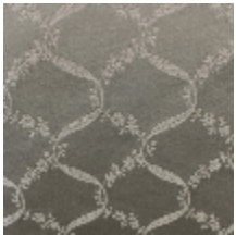
1663-01 CHOISY SEMÉ - IVOIRE