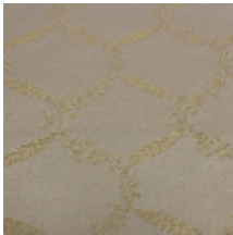
1663-02 CHOISY SEMÉ - TILLEUL *