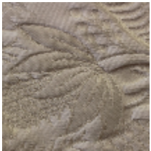
1664-01 TRIANON - IVOIRE