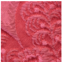
1664-07 TRIANON - RUBIS