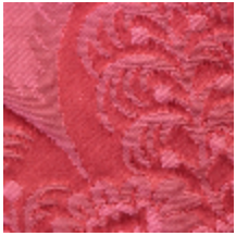
1664-07 TRIANON - RUBIS