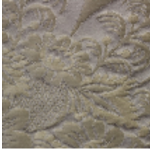
1664-02 TRIANON - PERLE