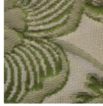
1664-04 TRIANON - VERT