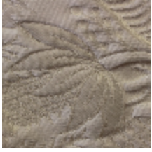
1664-01 TRIANON - IVOIRE