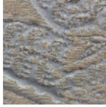
1664-03 TRIANON - NATTIER