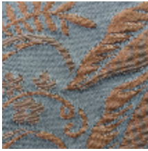
1664-08 TRIANON - BLEU