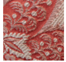
1664-06 TRIANON - ROUX