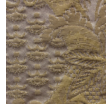
1664-05 TRIANON - OR