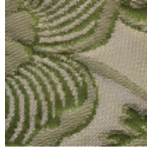
1664-04 TRIANON - VERT