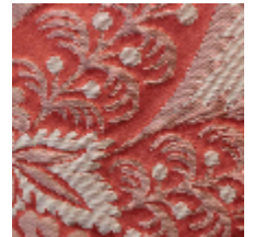
1664-06 TRIANON - ROUX