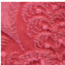
1664-07 TRIANON - RUBIS