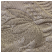
1664-01 TRIANON - IVOIRE