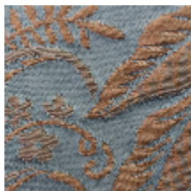
1664-08 TRIANON - BLEU