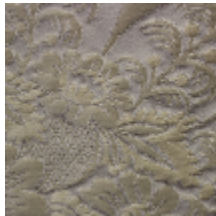
1664-02 TRIANON - PERLE