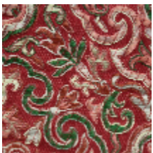
1665-07 GUIMET - RUBIS