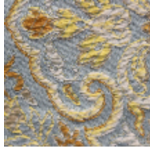
1665-03 GUIMET - NATTIER