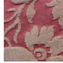
1668-06 GRAND DAUPHIN - TAMARIS