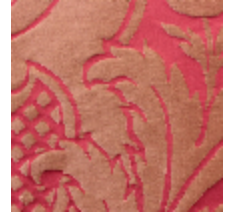
1668-07 GRAND DAUPHIN - ECARLATE