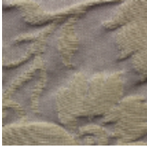
1668-02 GRAND DAUPHIN - PLATINE