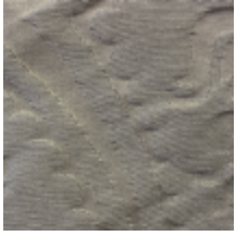
1668-01 GRAND DAUPHIN - IVOIRE