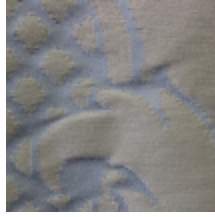
1668-04 GRAND DAUPHIN - SEVRES