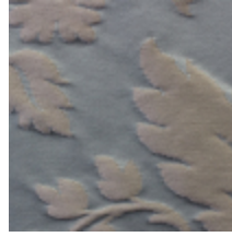
1668-05 GRAND DAUPHIN - JADE